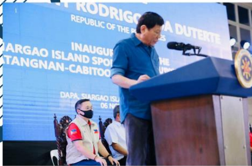
INAUGURATION OF THE THREE-POINT BRIDGE SYSTEM, SPORTS AND TOURISM COMPLEX OF SIARGAO ISLAND LED BY PRESIDENT RODRIGO ROA DUTERTE WITH SENATOR BONG GO