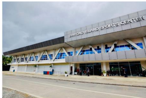
SIARGAO ISLAND SPORTS CENTER